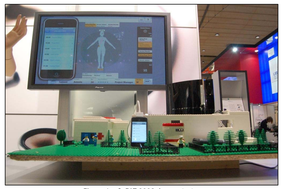
Figure 1 – CeBIT 2009 demonstrator