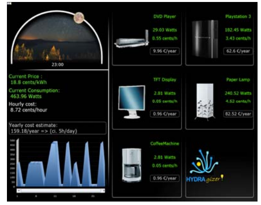
Figure 5 - Energy monitoring via PC

Each device in a household is given a power plogg, which is a small adapter located between the power plug and the power outlet. It reports the power consumption at any given time to a PC via a radio signal. People can tell which device is guzzling the most energy by taking a look at the computer monitor.