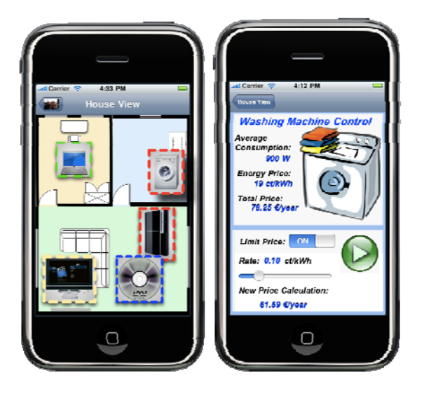
Figure 3 - Energy monitoring via cell phone

There exists also a far more convenient way to access the information by using a smart phone. The display and control unit on the smart phone allows people to check the energy consumed by their devices or appliances even remotely. For example, it can be used to display the consumption by room, switch devices on and off, and dim lights as figure 3 demonstrates.