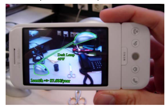
Figure 4 - Magic Lens

Furthermore the demonstrator offers another special attraction. The smart phone's camera can for instance be used as a "magic lens". If a consumer points the camera at the device in question, the real-time power consumption is shown.