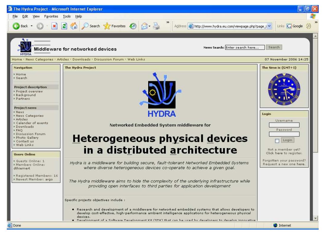
Figure 1 Opening screen of the Hydra web site

News, articles and photos can be commented on and rated by members. It may be necessary to edit comments, so the administrator has the ability to edit (or delete) all comments.